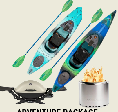
ADVENTURE PACKAGE $3,225 VALUE